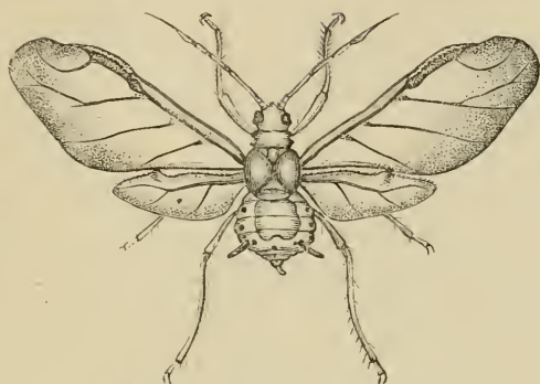
Siphonophora coreopsidis. THOS.